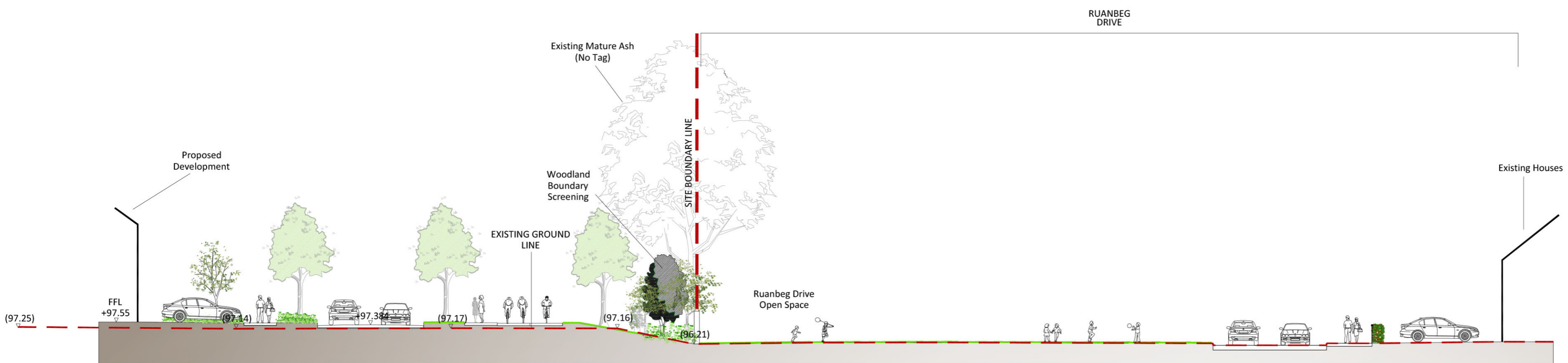
Option 2: Ruanbeg Drive - Remove Boundary Wall and Integrate Open Spaces (SUBJECT TO AGREEMENT WITH LOCAL AUTHORITY)